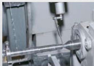
Head or Table mounted shoulder Probing options