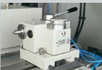
Taper Correction Tailstock option