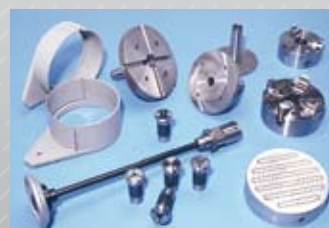
Chuck, Collets and Steadies