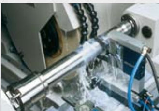
Gauging Options including - Shoulder, Diameter & Gap Elimination

A few of the most popular items of optional equipment available for Suprema are shown below, many more are available on request.