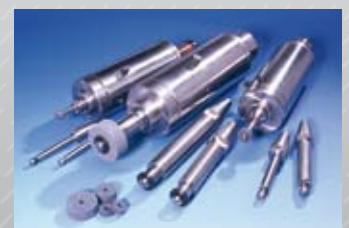
Standard and variable speed Internal grinding spindle options