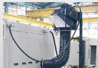
Coolant and Mist Extraction options