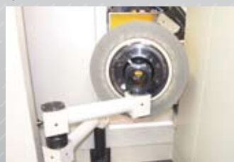
Wheel carousel and wheel loading options