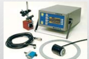
Auto and semi auto Wheel balancing options