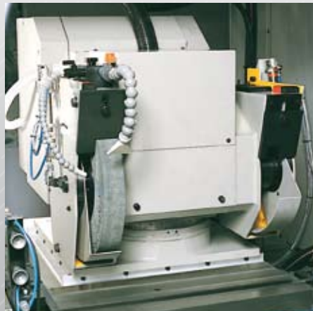
Universal Swivelling Wheelhead