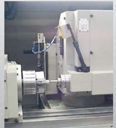
Universal Wheelhead set in Internal Mode